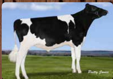
Westcoast MACADAM 0200HO10646 SILVER X MUNITION X SNOWMAN

One of the most rewarding things we see here is the young donors coming in that we've helped create, knowing that many are full sisters to bulls you will be using, like some of those mentioned. When you're collecting those juvenile donors it becomes more and more apparent how the IVF technology fits into today's genetics industry.