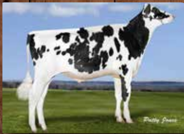
Westcoast PLEDGE 0200HO10644 PULSAR X SHAN X PLANET

Call us today to get started on your breeding program 1.800.657.5613.