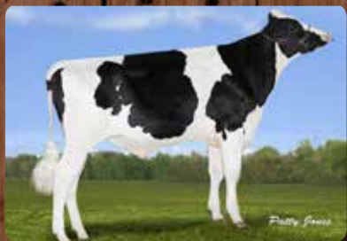
Westcoast RANDALL 0200HO10641 LOPTIMUM X NUMERO UNO X ROBUST

Two examples, Westcoast RANDALL and Westcoast PLEDGE are new Genomax sires – both are among a very elite group of bulls that offer +3400 LPI and +12 Conformation and both will have sons at Semex in a year's time. Two more Genomax bulls – MACADAM and TICKET are now also available to producers and there will be many more making their debut in the coming year.