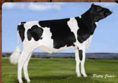
Westcoast TICKET 0200HO10645 SILVER X TANGO X MAN-O-MAN

1625 Angus Campbell Rd. Abbotsford, BC, V3G 2G4