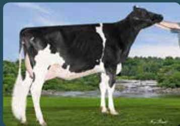
Dusoleil Louis Elyse VG-85-2YR-CAN

Geranette LOUIS - Lavaman x Bolton - Louis is a rare addition to our Proven list that is truly new. He hadn't been identified for early marketing as a Genomax sire, so in essence he is a sire that beat the odds by delivering better daughters than his genomic prediction suggested. Louis has also earned the Repromax designation. That he offers a somewhat unique pedigree that traces to the tried and true Laurie Sheik family is yet another reason for considering him. Louis delivers extreme protein percent like his sire Lavaman (Man O Man from Lila Z family) but, with much better overall Conformation. With double digit ratings for Conformation, Mammary, Feet & Legs and Dairy Strength, consider Louis if trend lines for key Type benchmarks are not keeping pace. Louis did it the hard way - he earned the right for your consideration.